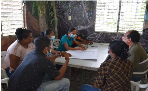
Figure 2: Cluster members drafting their vision, mission and bylaws

For more information on the Experience Nariva project, visit: https://canari.org/experience-nariva-creating-a-community-driven-sustainable-cluster-and-brand-to-transform-ecotourism/