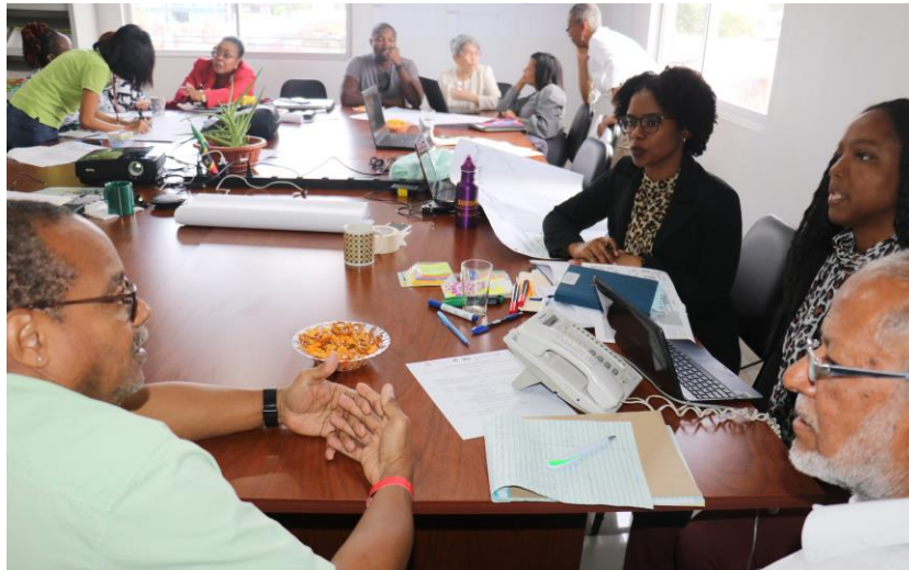
Figure 1. Catalysts reflect on their role in small groups