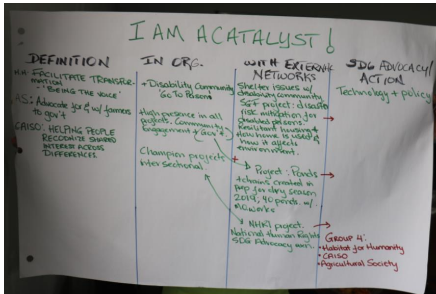
Figure 2. Sample results of small group work by Catalysts

A whole group exercise was then held where Catalysts reviewed the challenges and enabling factors that impacted their involvement in the capacity building interventions and other key activities under the project.