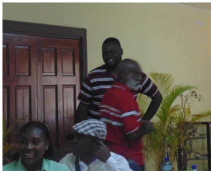
Figure 1 Participants discussing the title of the video.

Fisherfolk did not attend the first workshop on August 13, 2014. Mobilisers initially did not understand the process and consequently could not explain it properly to potential participants. CANARI met with mobilisers to explain the process and assisted by calling potential participants. Facilitators were also told that the fisherfolk were engaged in other activities and were unwilling to attend another 'talk shop'. Subsequent meetings were attended by fisherfolk.