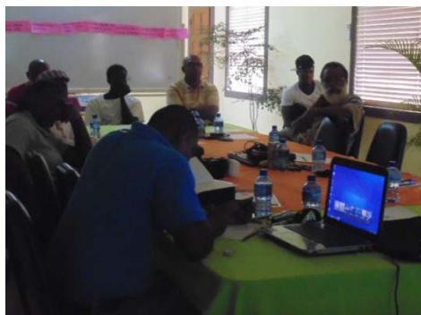
Figure 2 Participants determining messages for the video.

The participants from Toco have committed to hosting a meeting with target audiences in their community on a date to be determined. The video can be seen at https://www.youtube.com/watch?v=Gw4Tffu4tZQ .