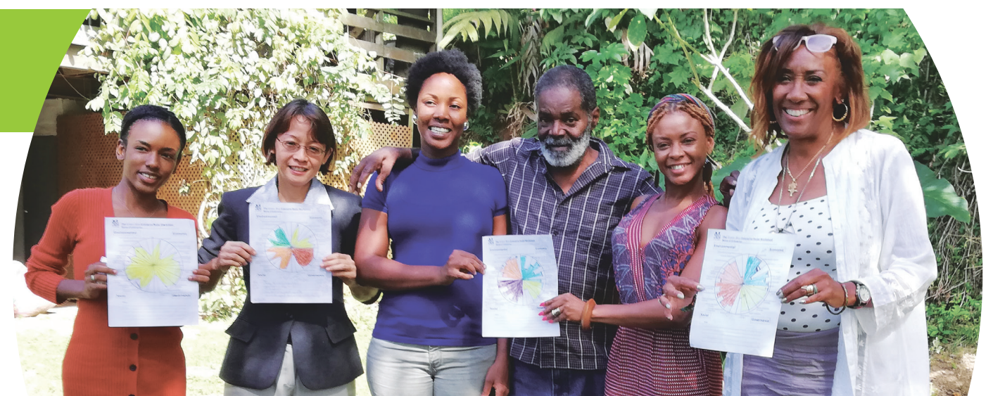
Green Market Santa Cruz members assessed how their SME delivers economic, environmental and social co-benefits using the Radar.