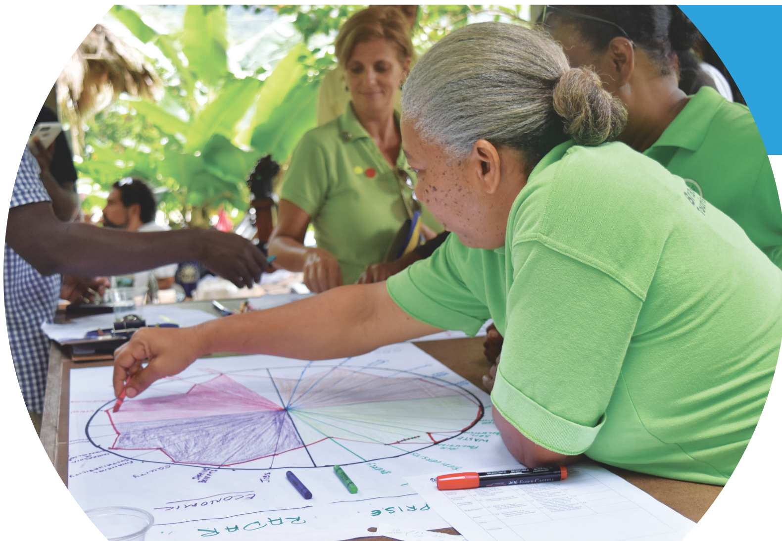
The Radar is easy to create, understand and analyse.