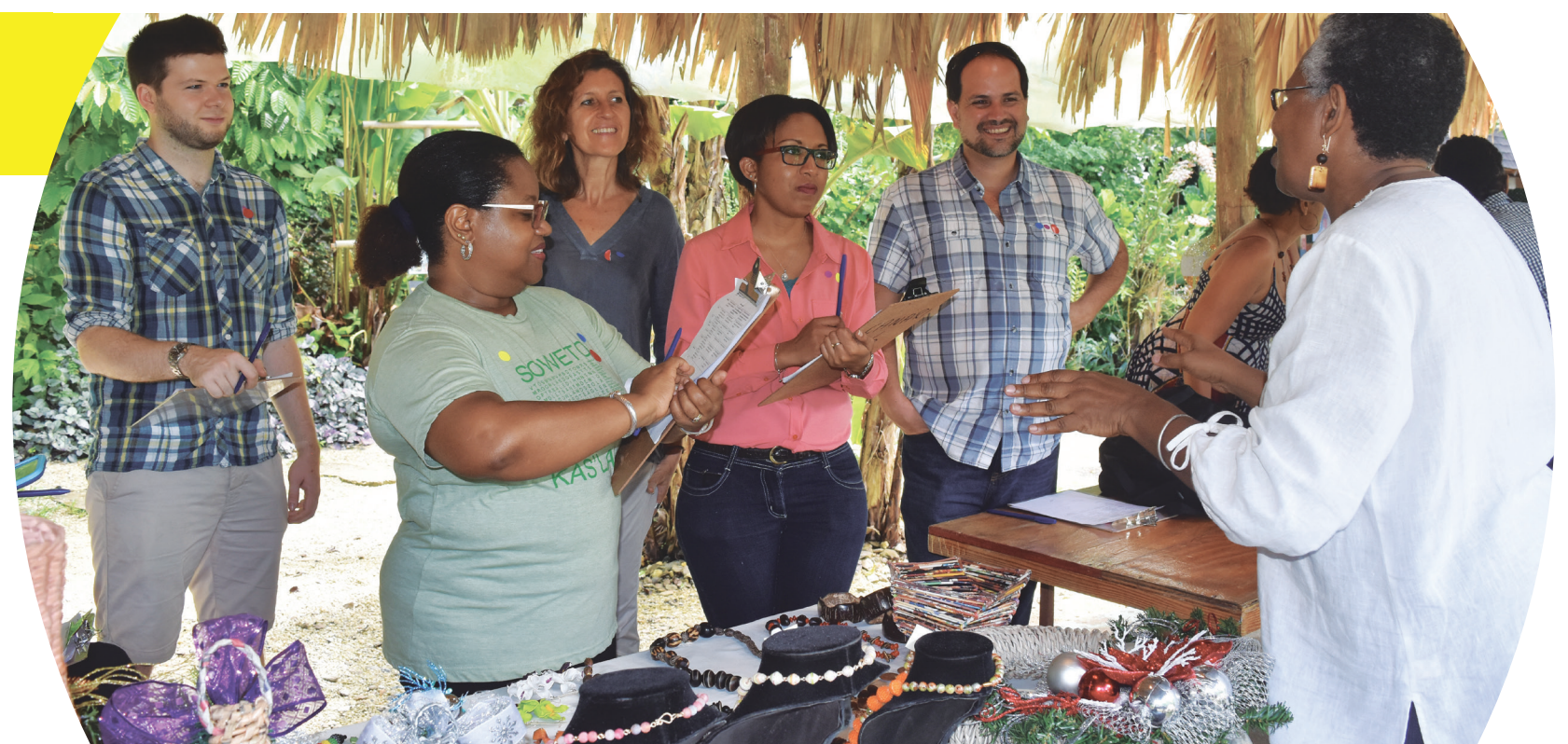
The Radar tool helps local SMEs celebrate their successes while identifying areas for growth.

The Local Green-Blue Enterprise Radar is being developed by the Caribbean Natural Resources Institute (CANARI) through an action research and learning process working with entrepreneurs and support agencies in the Caribbean. Their input and guidance during piloting is shaping how the Radar can become a useful tool for community small and micro-enterprises (SMEs). CANARI is creating a toolkit for facilitators to use the Radar. This will contribute to CANARI's work to promote SMEs as a pathway for transformation to more environmentally sustainable, inclusive and resilient economies in the Caribbean.