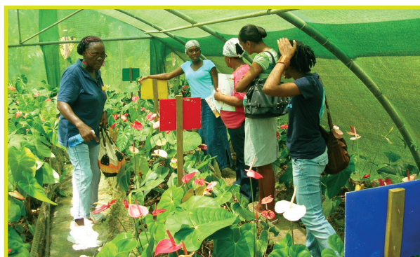
The Clozier Youth Farmers in Grenada have a greenhouse where they grow anthuriums for the hotel industry.

capacity of local communities to develop their own strategies for sustainable forest-based livelihoods. Examples of initiatives where the government is more playing a directing role are the National Reforestation and Watershed Rehabilitation Programme in Trinidad and Tobago and the Water Catchment Groups in Saint Lucia. Examples where the government is playing a more facilitating and supporting role are include the Local Forest Management Committees in Jamaica, the Integrated Forest Management and Development Programme in St. Vincent,