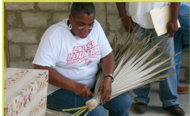
Superior Broom Producers in Saint Lucia make brooms using the latanye palm.