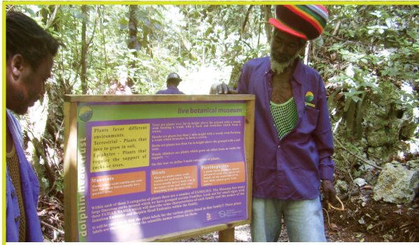
Members of the Dolphin Head Local Forest Management Committee in Jamaica explain features of the nature trail in the Dolphin Head Forest Reserve where they conduct tours.