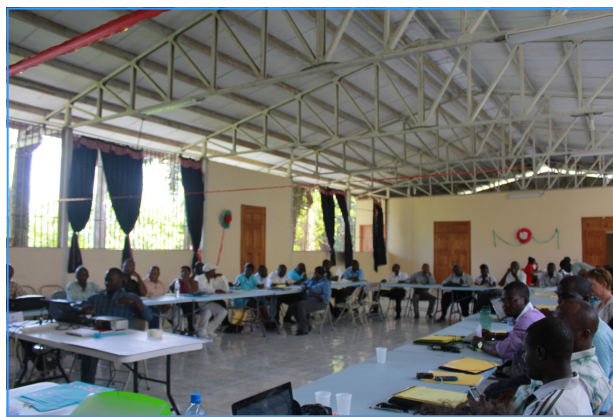
There was a great turn out of participants with representatives from local civil society, community groups, donors and government departments