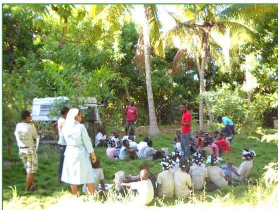
Outdoor educational activities for school children.

FoProBiM is currently undertaking a project supported by the CEPF with the objectives of protecting and managing mangroves, fisheries and sea turtles along Haiti's northern coast while also seeking to determine the possibilities for sustainable eco-tourism initiatives.