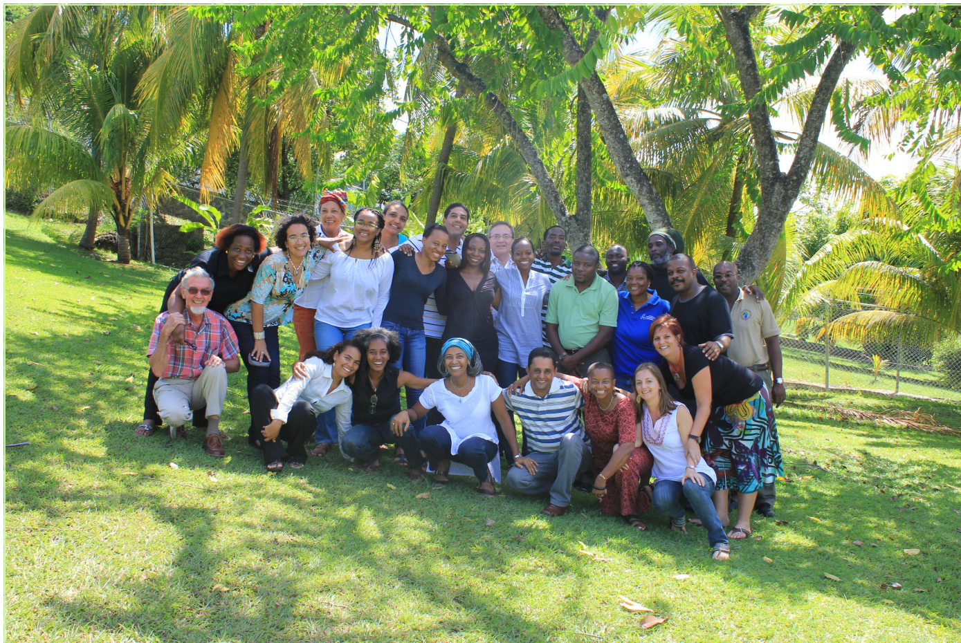
The group of mentors from across the Caribbean gather for a photograph during a break between training sessions at their workshop in St. Vincent and the Grenadines, October 2011.

Mentors from six islands (Antigua and Barbuda, Barbados, Dominica, Grenada, Saint Lucia and St. Vincent and the Grenadines) have also been facilitating national training activities/workshops over the month of June 2012 and will continue these activities in July 2012. After the follow-up training by CANARI, this team will be well prepared to strengthen the capacity of CEPF applicants in their proposal development and project implementation.