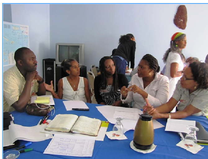
Workshop group discussing what they believe is the definition of a mentor

The workshop was very participatory in nature and confirmed the willingness of the mentors to help build the capacity of civil society to play a more effective role in biodiversity conservation in their countries. Participants were able to define what mentoring means to them and explored the different capacities that are needed to be an effective mentor. In particular, mentors built and strengthened their capacity in participatory problem analysis and identification; project planning and proposal writing; and participatory facilitation.